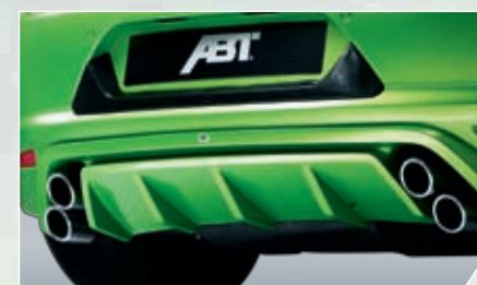
ABT rear muffler. Made of stainless steel, with four chrome tailpipes.