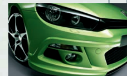
ABT front skirt. Energy-laden exclusivity in OEM quality.