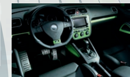
ABT interior. Sporty interior with aluminium pedals and foot rest, leather gear shift knob and steering wheel tag with logo.