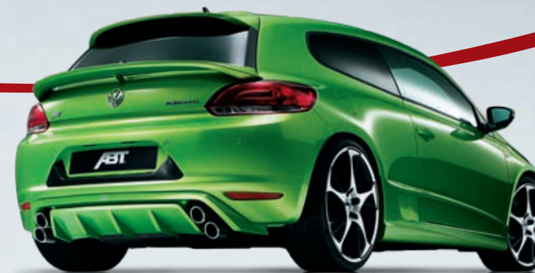
ABT BR sports wheel. Diamond-machined, deepblack matt finished or high-gloss polished with optional concealed valves, weight-optimized and providing perfect handling.

... and reap the whirlwind. Or in this case, a uniquely sporting, on-road experience. Named after a hot Saharan-Mediterranean wind, the Scirocco kicked up a real storm – of praise and market appreciation – when it first debuted back in 1974. Now, it's celebrating its comeback – and like a breath of fresh air: with increased power ratings up to 240 hp, elegantly aerodynamic add-on body components, dynamic chassis and suspension technology and much much more, the experts at ABT have breathed yet more life into the latest generation of this spectacular sports coupe. But the ABT Scirocco is also fully on message with the wind of change: the 1.4 TSI engine, for instance, churns out a massive 210 hp – more power than the larger 2.0 TSI power unit in its series-production form – while offering a significant reduction in fuel consumption at the same time.