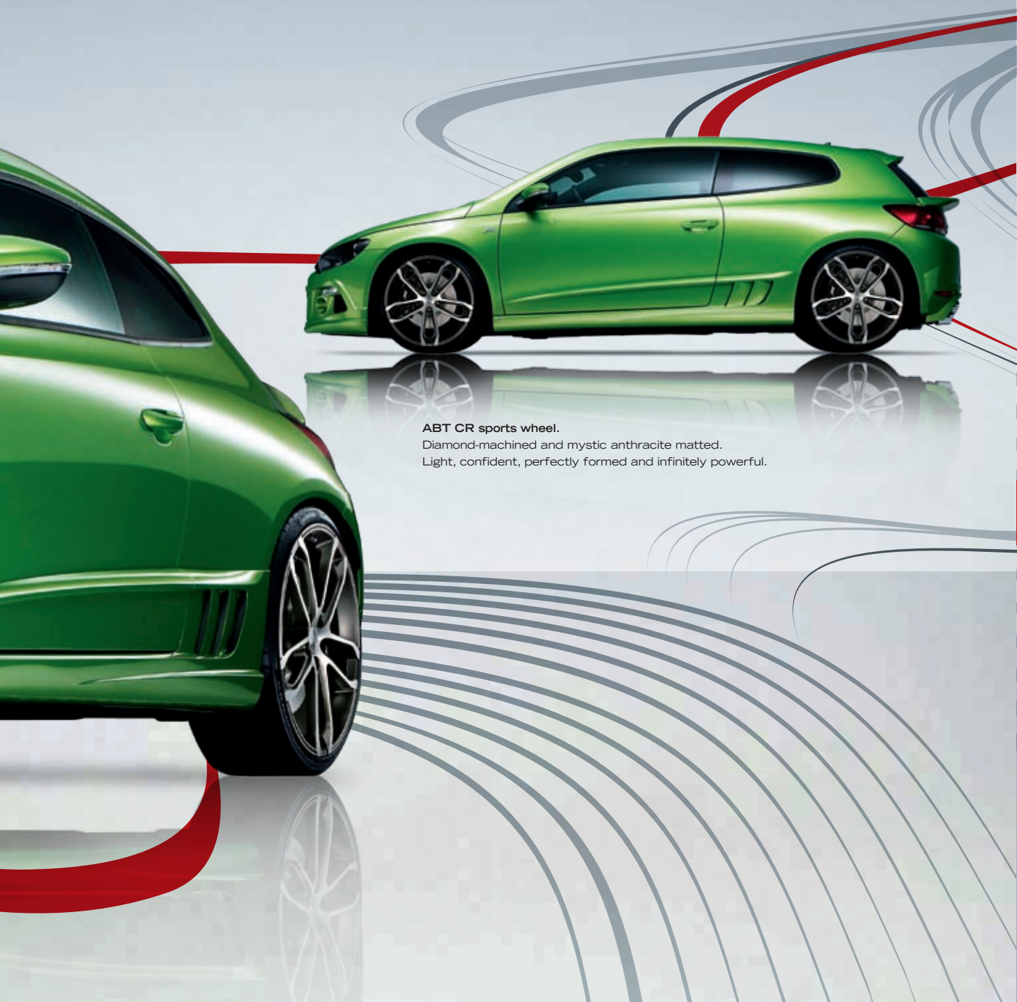
ABT CR sports wheel. Diamond-machined and mystic anthracite matted. Light, confident, perfectly formed and infinitely powerful.