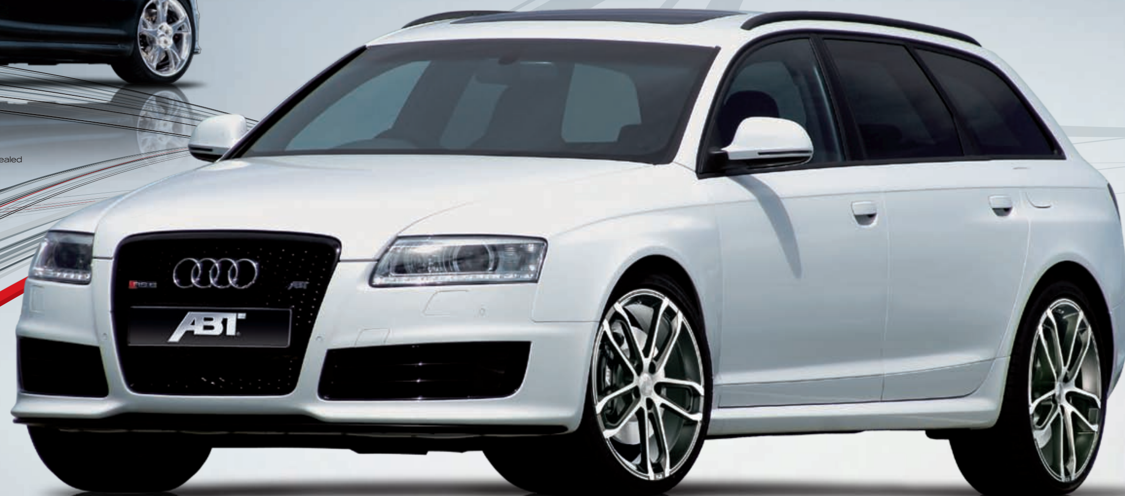
ABT CR sports wheel. Diamond-machined and mystic anthracite matted. Light, confident, perfectly formed and infinitely powerful.