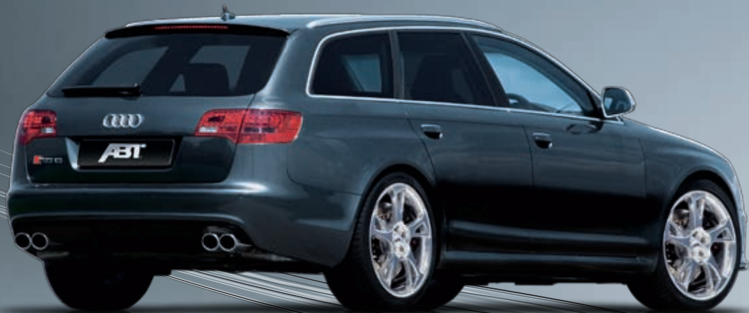
ABT BR sports wheel Diamond-machined or high gloss polished, optional with concealed valves, weight-optimized and perfect to handle.