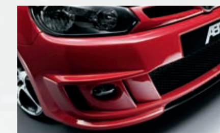
ABT front skirt. Energy-laden exclusivity in OEM quality.