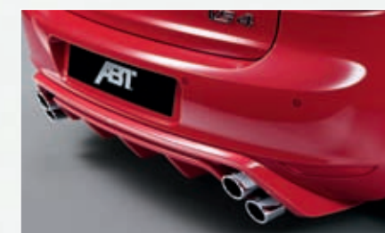
ABT rear skirt set. The crowning glory for a uniquely sporty profile.