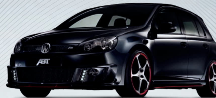
ABT BR sports wheel. Diamond-machined, deepblack painted or high-gloss polished, with optional concealed valves, weight optimized and providing perfect handling.

What more can one say about a car that has been one of the most successful models of all time over the past three and a half decades and after which an entire class of vehicles is named? Perhaps that the latest generation of this state-of-the-art Volkswagen Golf lays down the benchmark in every respect – and that despite this fact, ABT has once again succeeded in applying the perfecting touches: dynamically elegant bodywork components, the very finest in automotive technology and an impressive hike in the engines' power output put this 'classic car' in a class of its own, enabling this German legend to once more take off where we at ABT last left off. And the same goes for efficiency, too: for example, after undergoing the ABT treatment, the works 1.4 TSI, 122 hp engine now outputs a genuinely powerful 160 hp. In so doing, it matches the performance ratings of the next step up on VW's standard power-output ladder for its 1.4 TSI unit – while offering a significant reduction in fuel consumption at the same time.