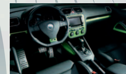
ABT interior. Sporty interior with aluminium pedals and foot rest, leather gear shift knob and steering wheel tag with logo.