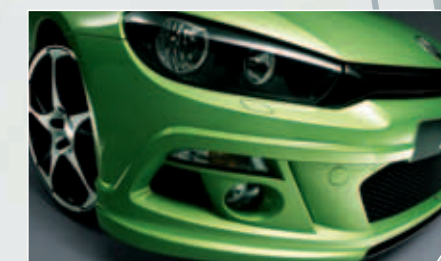
ABT front skirt. Energy-laden exclusivity in OEM quality.