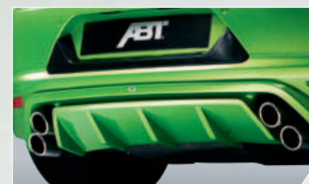
ABT rear muffler. Made of stainless steel, with four chrome tailpipes.

... and reap the whirlwind. Or in this case, a uniquely sporting, on-road experience. Named after a hot Saharan-Mediterranean wind, the Scirocco kicked up a real storm – of praise and market appreciation – when it first debuted back in 1974. Now, it's celebrating its comeback – and like a breath of fresh air: with increased power ratings up to 240 hp, elegantly aerodynamic add-on body components, dynamic chassis and suspension technology and much much more, the experts at ABT have breathed yet more life into the latest generation of this spectacular sports coupe. But the ABT Scirocco is also fully on message with the wind of change: the 1.4 TSI engine, for instance, churns out a massive 210 hp – more power than the larger 2.0 TSI power unit in its series-production form – while offering a significant reduction in fuel consumption at the same time.