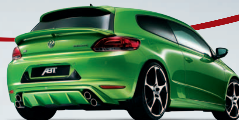
ABT BR sports wheel. Diamond-machined, deepblack matt finished or high-gloss polished with optional concealed valves, weight-optimized and providing perfect handling.