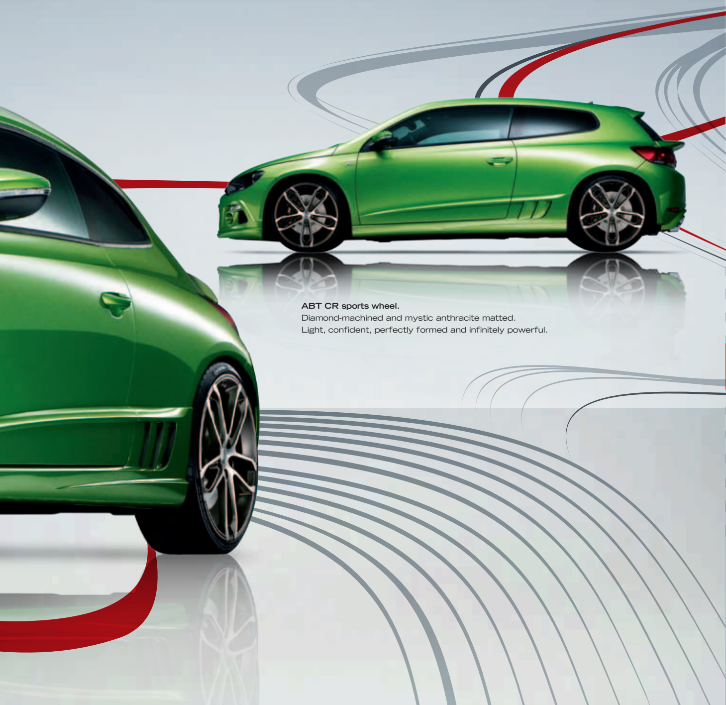
ABT CR sports wheel. Diamond-machined and mystic anthracite matted. Light, confident, perfectly formed and infinitely powerful.